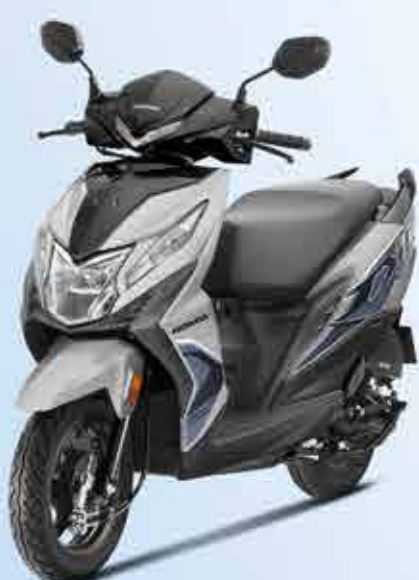
PEARL IGNEOUS BLACK + PEARL DEEP GROUND GRAY